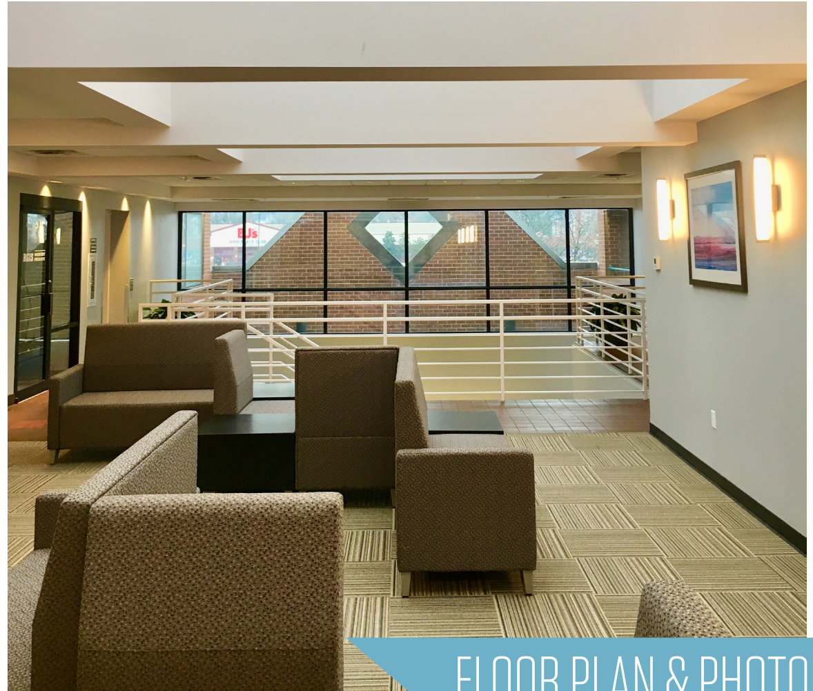
FLOOR PLAN & PHOTO