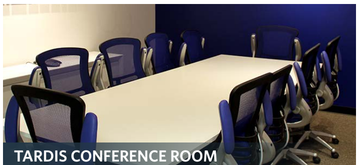
TARDIS CONFERENCE ROOM