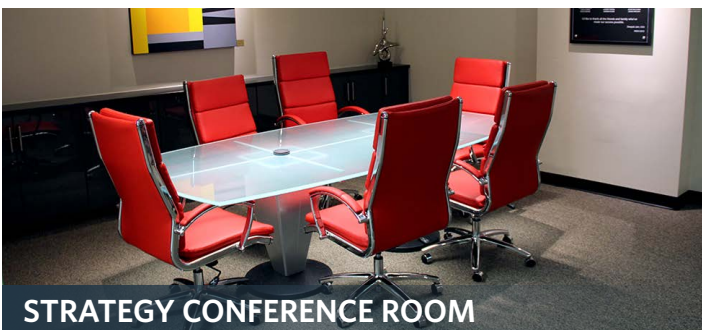
STRATEGY CONFERENCE ROOM