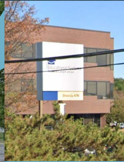
PYLON SIGNAGE ON ROUTE 29 EXIT