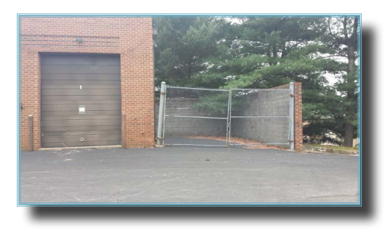
NOTE: ALL DIMENSIONS ARE APPROXIMATE