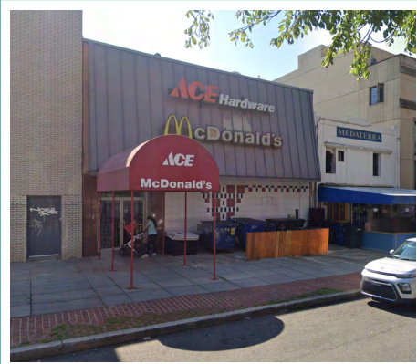
ENTRANCE & SIGNAGE FROM 24TH STREET, NW