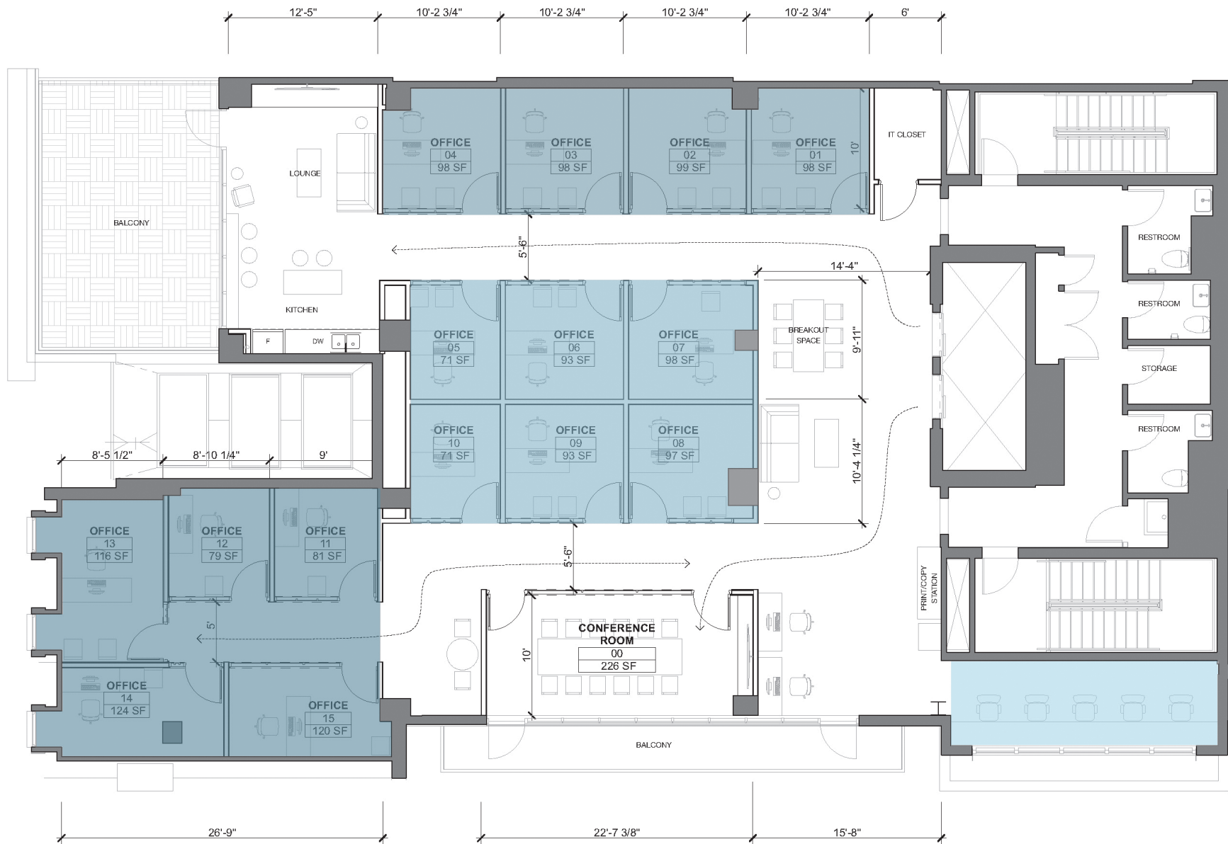
PROPOSED 4TH FLOOR PLAN (WITH PERMIT)