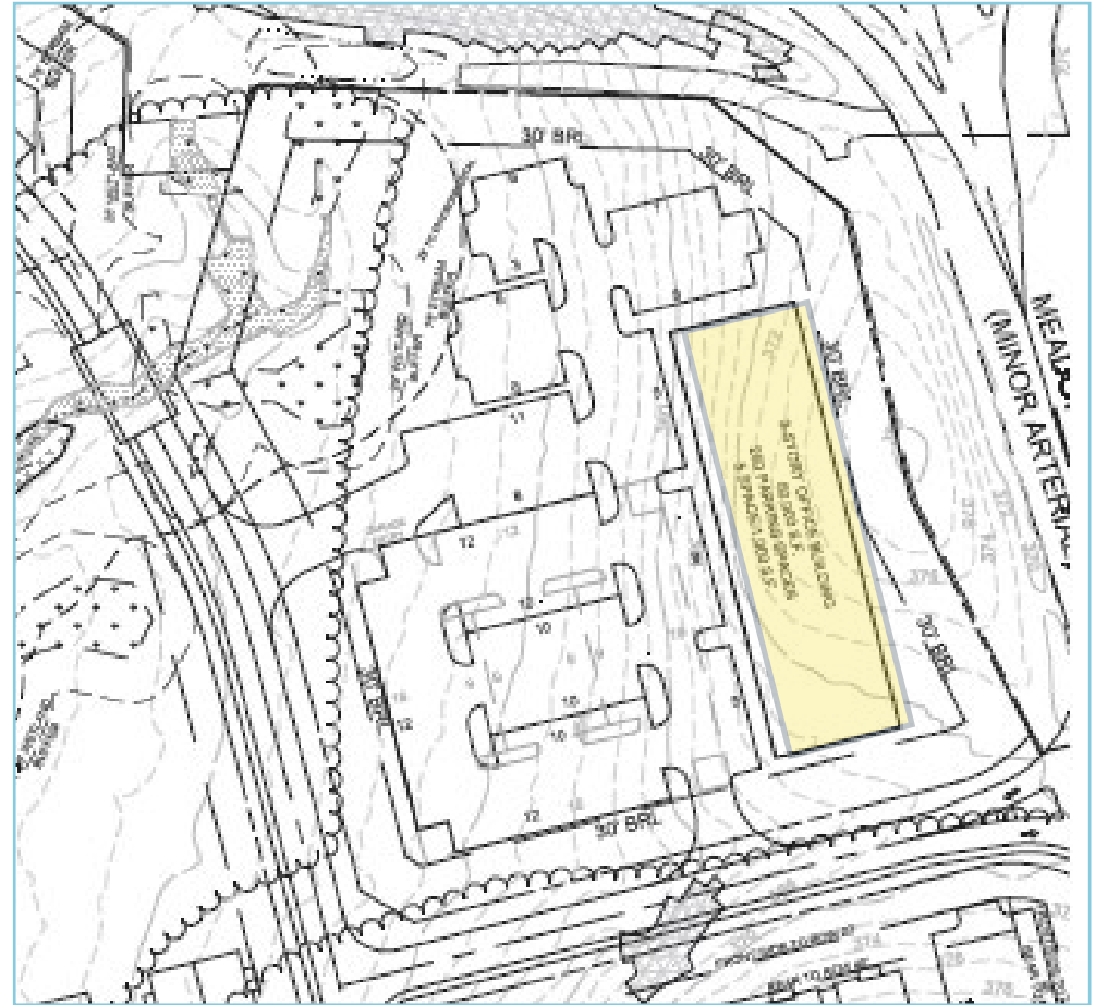
POR (PLANNED OFFICE RESEARCH) LAYOUT