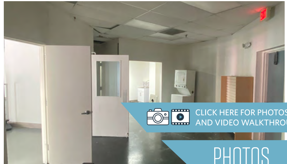
BACK OF HOUSE