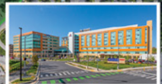
Adventist HealthCare White Oak Medical Center

300-acre community planned for 7M SF of commercial development and 5,000 residential units. Est. Delivery: TBD