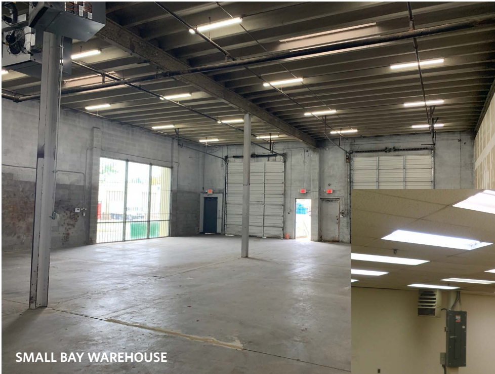
SMALL BAY WAREHOUSE