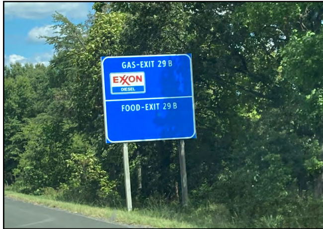
EXIT 29 B (NORTHBOUND 95)

11601-11735 Beltsville Drive, Beltsville, MD 20705 Prince George's County