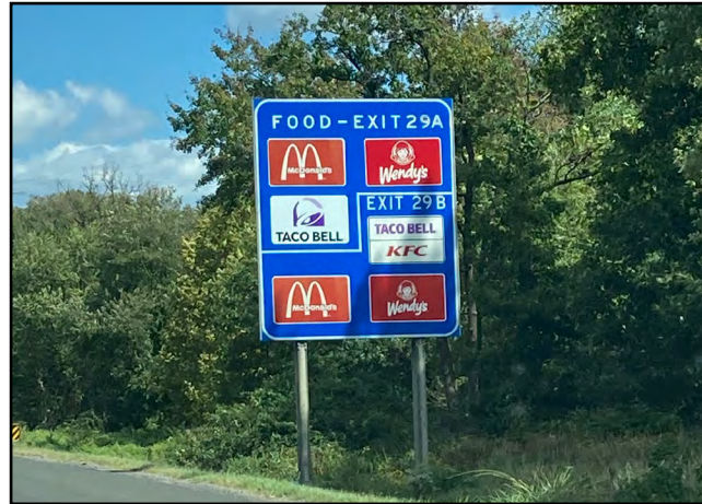
EXIT 29 A (NORTHBOUND 95)