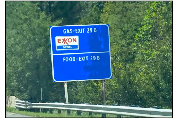
EXIT 29 B (SOUTHBOUND 95)