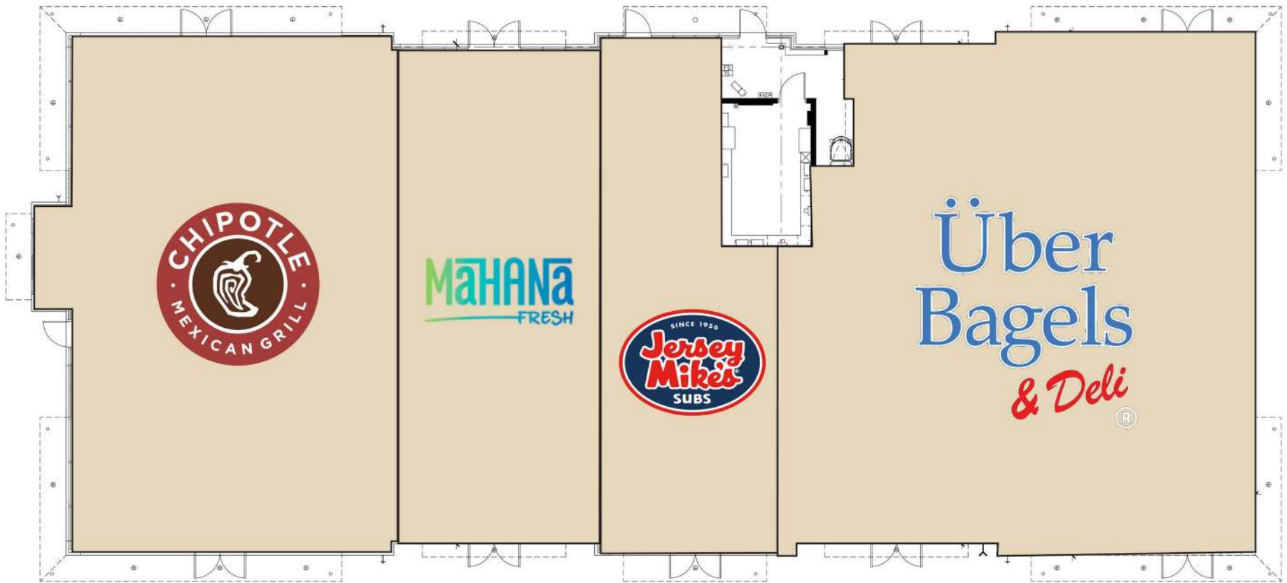
BLDG FLOOR PLAN

9801-9886 BROKEN LAND PKWY, COLUMBIA, MD 21046, HOWARD COUNTY