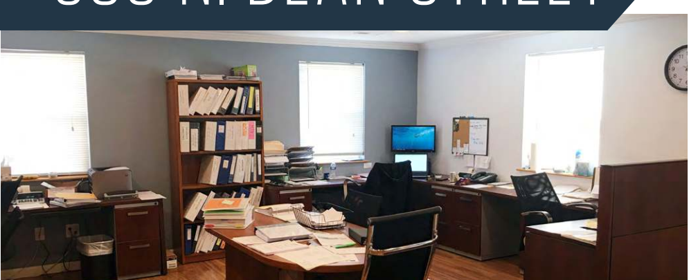
539 N. Dean Street, Baltimore, MD 21205 Baltimore City