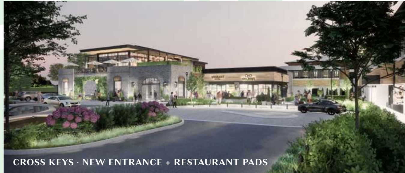
CROSS KEYS · NEW ENTRANCE + RESTAURANT PADS