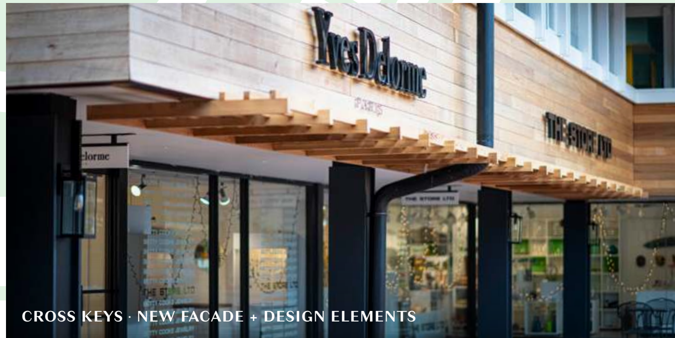
CROSS KEYS · NEW FACADE + DESIGN ELEMENTS