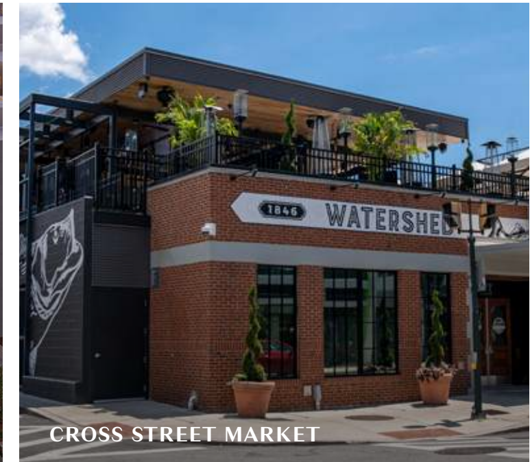
CROSS STREET MARKET