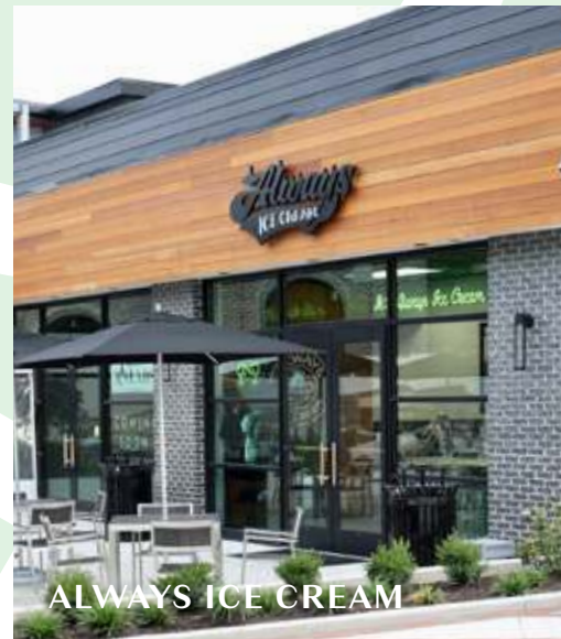
ALWAYS ICE CREAM