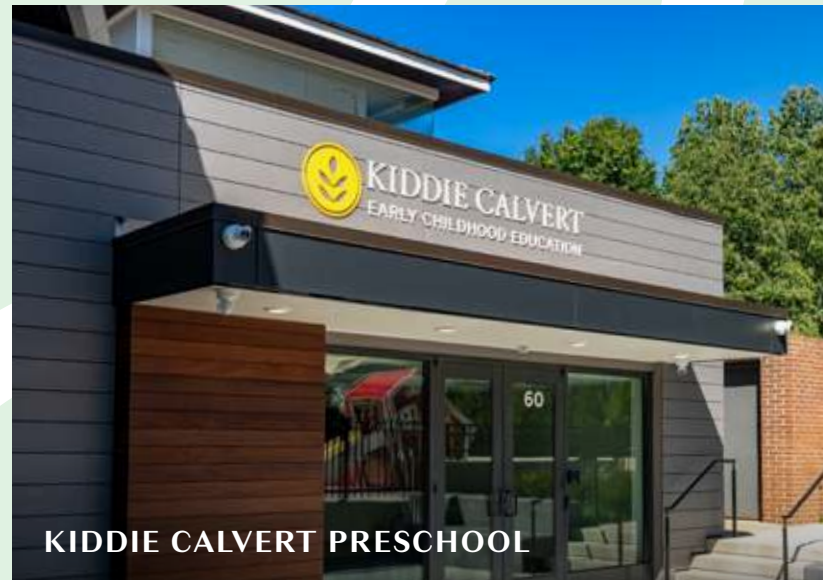
KIDDIE CALVERT PRESCHOOL