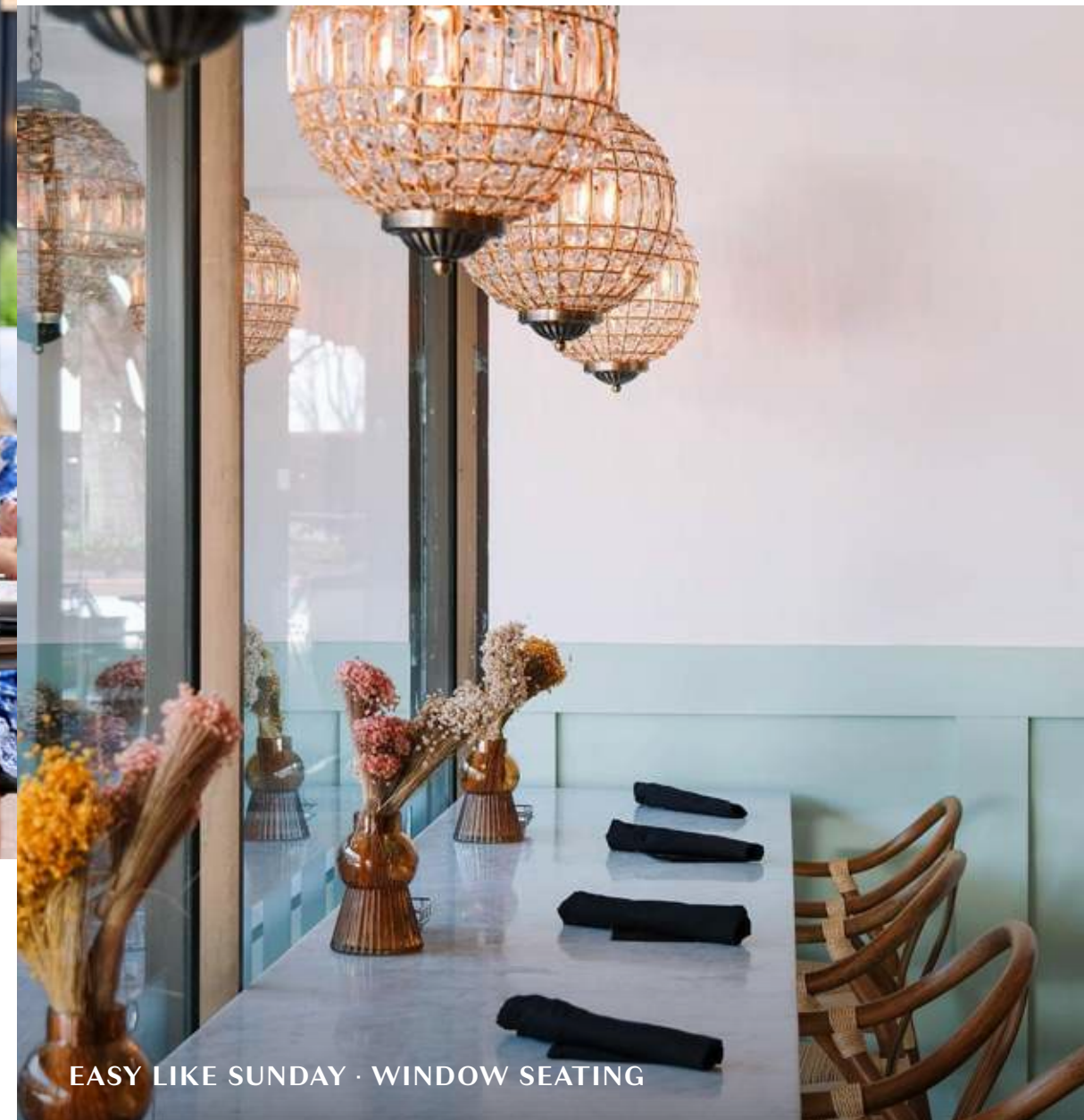
EASY LIKE SUNDAY · WINDOW SEATING