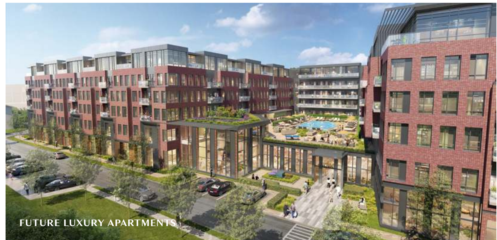
FUTURE LUXURY APARTMENTS