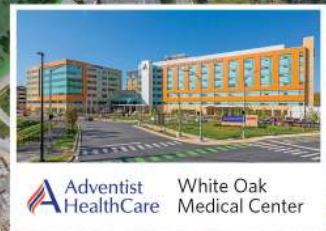
Adventist HealthCare White Oak Medical Center