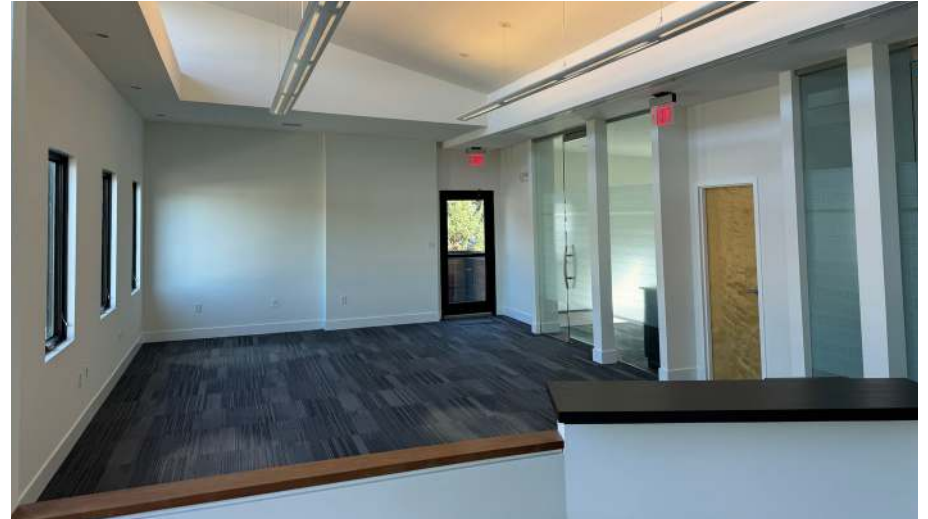
Reception/ Open Office Area