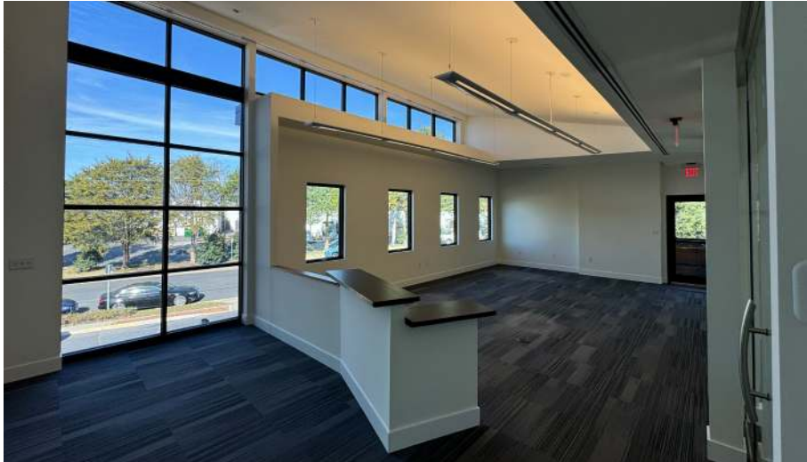
Reception/ Open Office Area