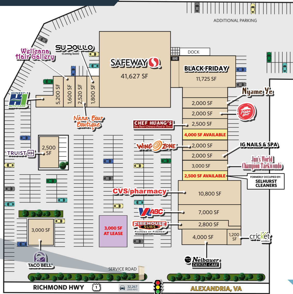
NEW PYLON SIGN

8626 Richmond Highway, Alexandria, VA 22309 Fairfax County