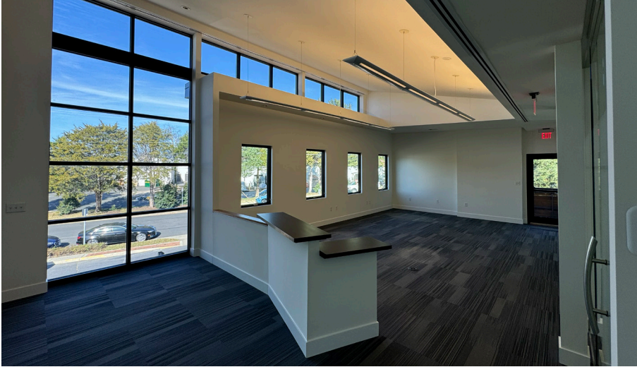
Reception/ Open Office Area