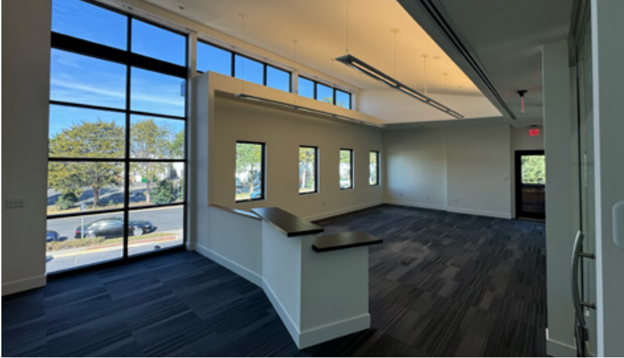
Reception/ Open Office Area