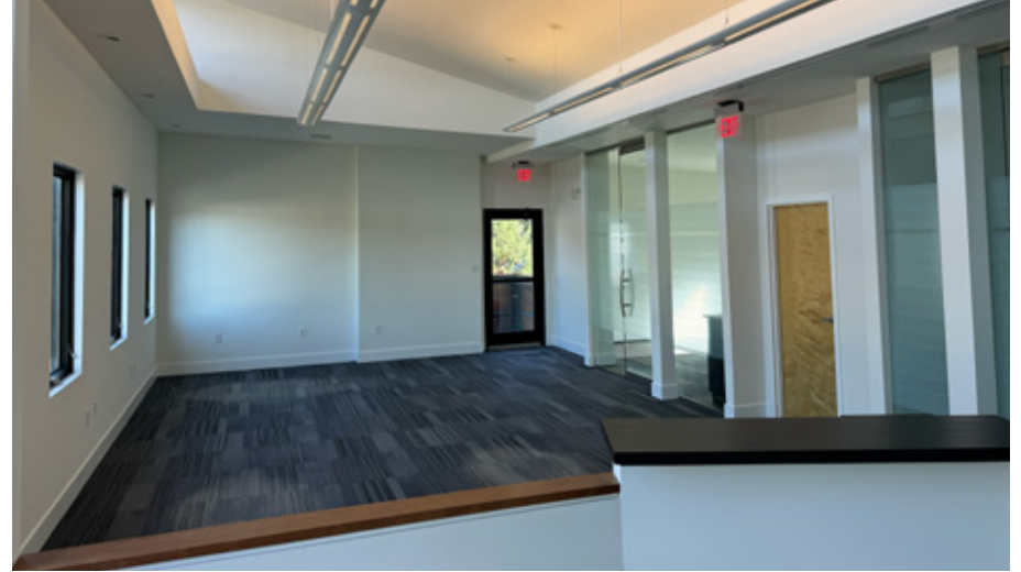
Reception/ Open Office Area