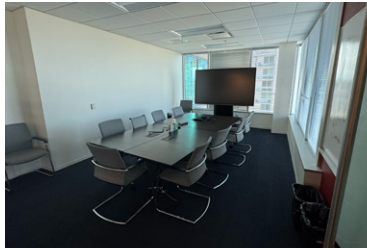
SMALL CONFERENCE ROOM