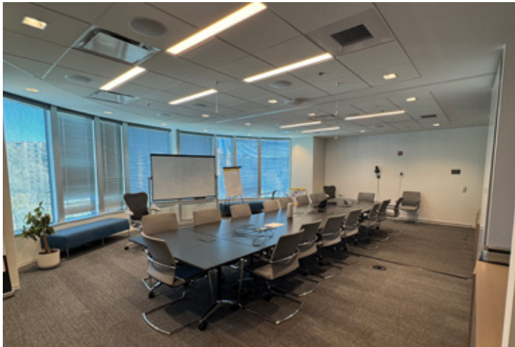
LARGE CONFERENCE ROOM WITH MOVABLE WALL TO SPLIT IN HALF