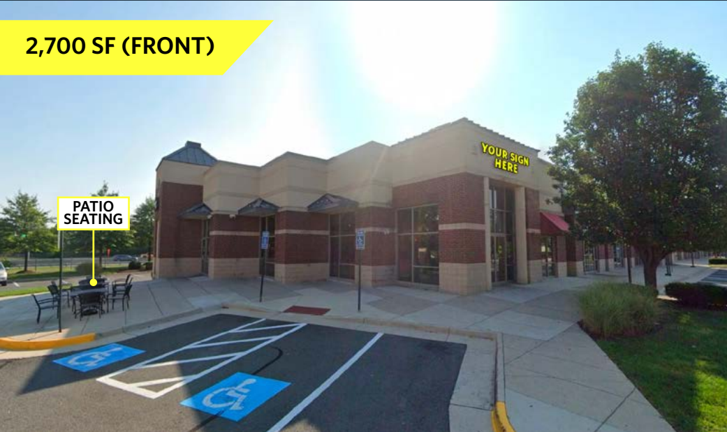
2,700 SF (FRONT)