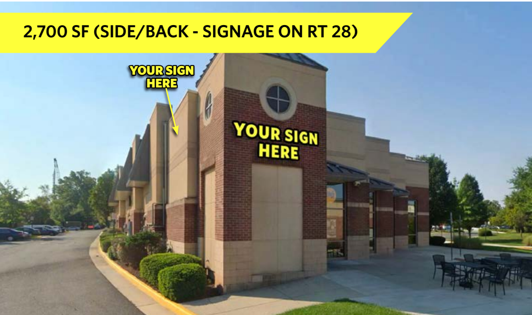
2,700 SF (SIDE/BACK - SIGNAGE ON RT 28)