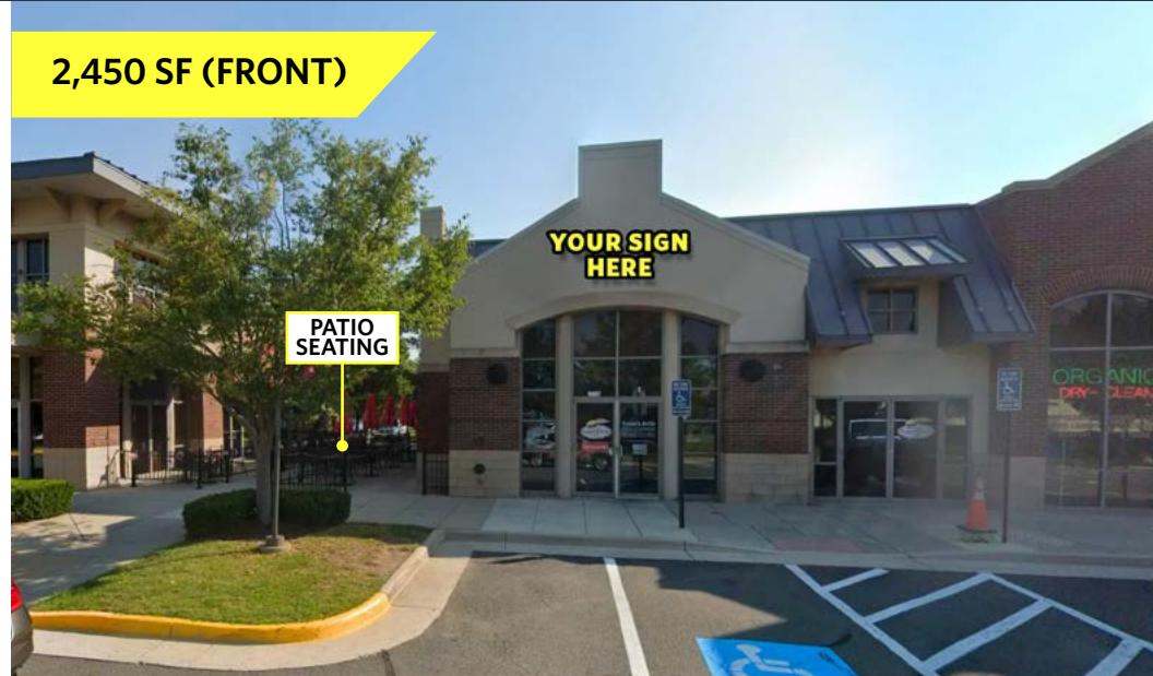
2,450 SF (FRONT)