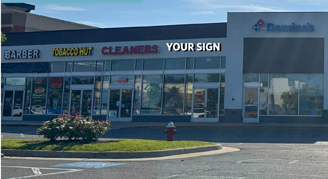
Suite 1110 - 1,048 SF