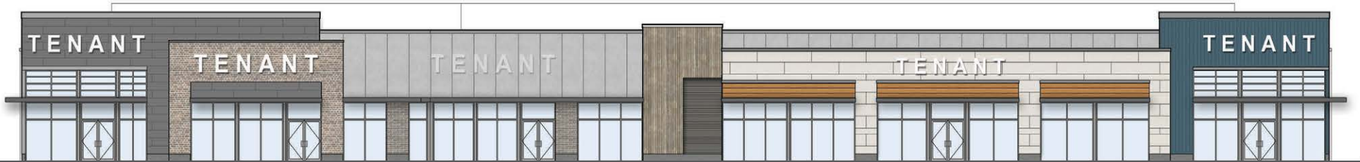
NORTH ELEVATION SCALE 1/8" = 1'-0"