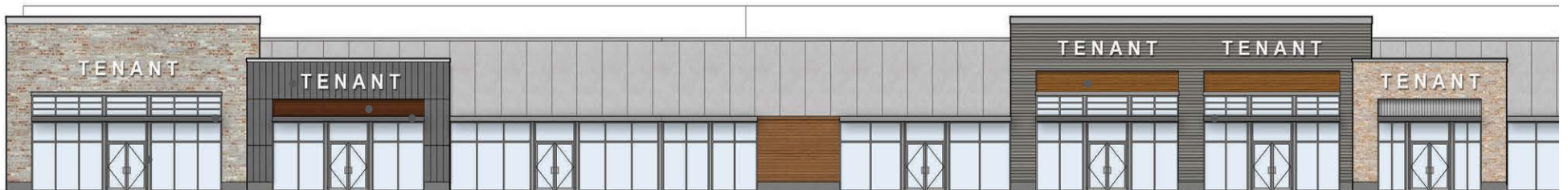
NORTH ELEVATION SCALE 1/8" = 1'-0"