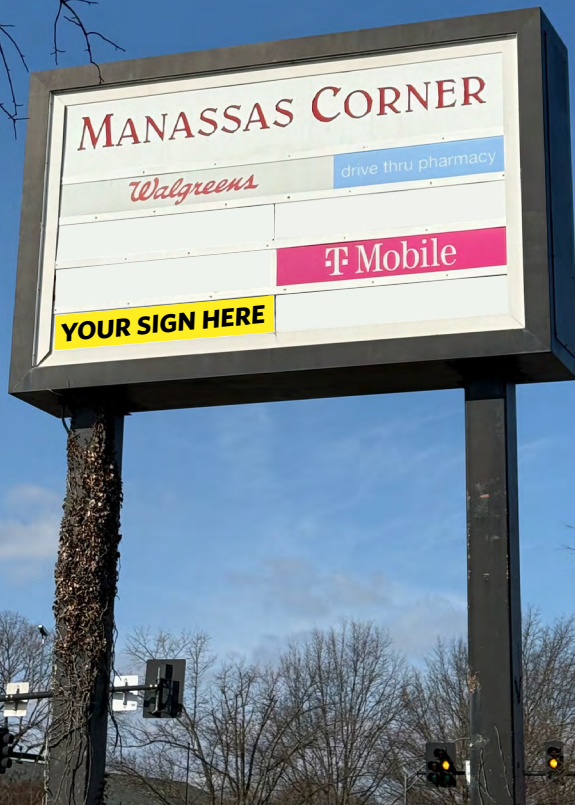
SUDLEY ROAD PYLON