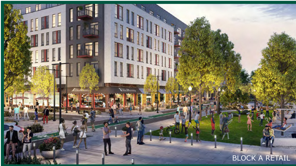
BLOCK A RETAIL