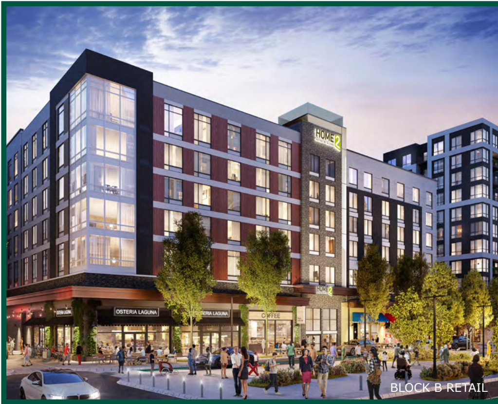
BLOCK B RETAIL