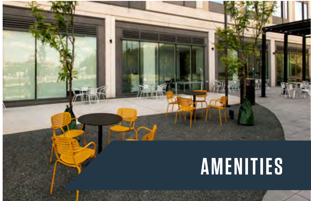
RESTAURANT LOCATED AT THE STELLA