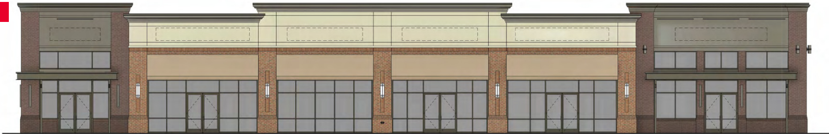
LOT 7 ELEVATION