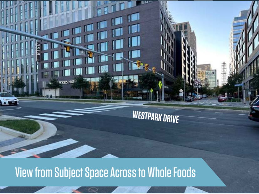
View from Subject Space Across to Whole Foods

WESTPARK DRIVE & BORO PLACE, TYSONS, VA 22102