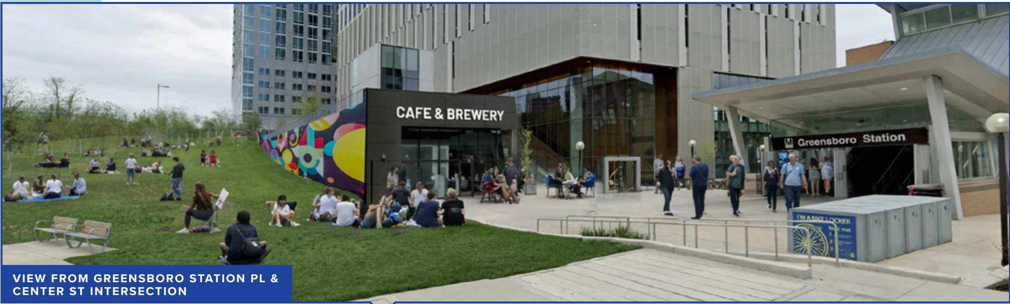
VIEW FROM GREENSBORO STATION PL & CENTER ST INTERSECTION