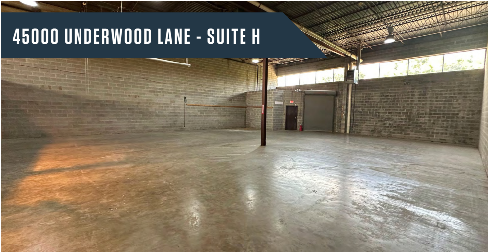
45000 UNDERWOOD LANE - SUITE H

45000-45064 Underwood Ln, Sterling, VA 20166