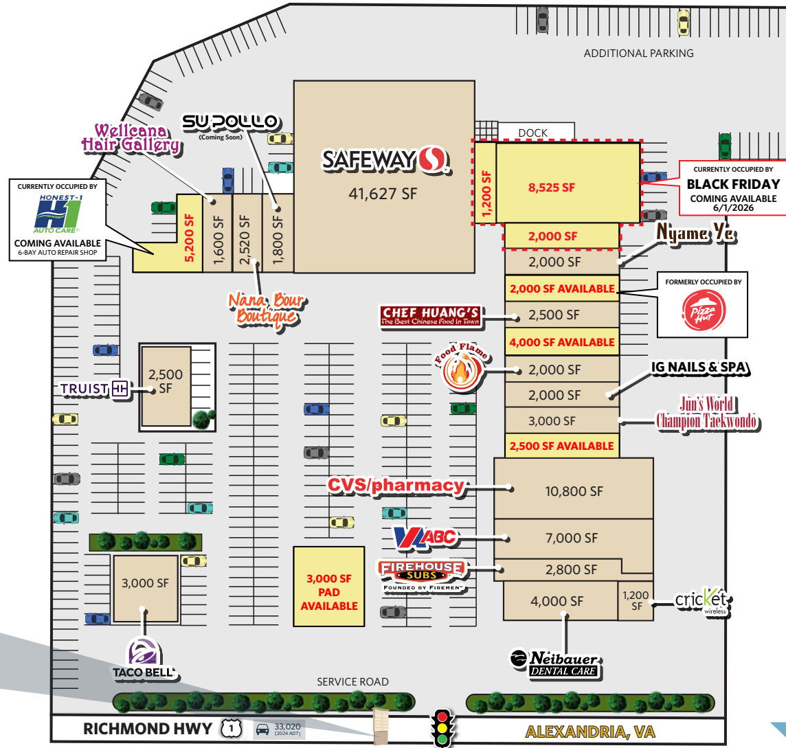
NEW PYLON SIGN

8626 Richmond Highway, Alexandria, VA 22309 Fairfax County